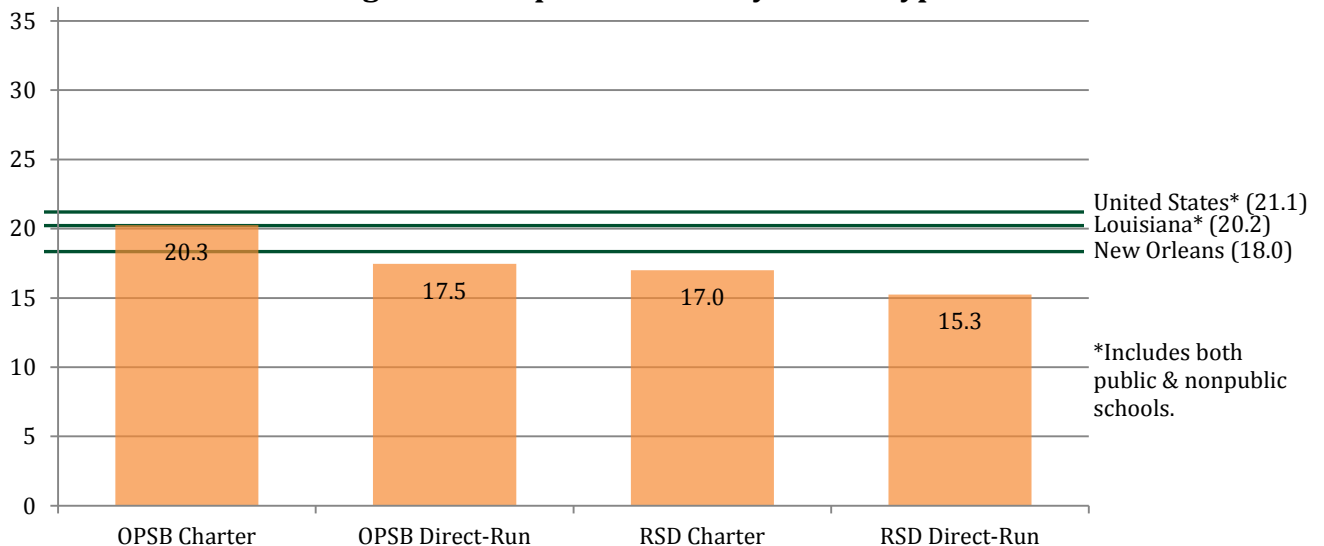
2011 Average ACT Composite Scores by School Type